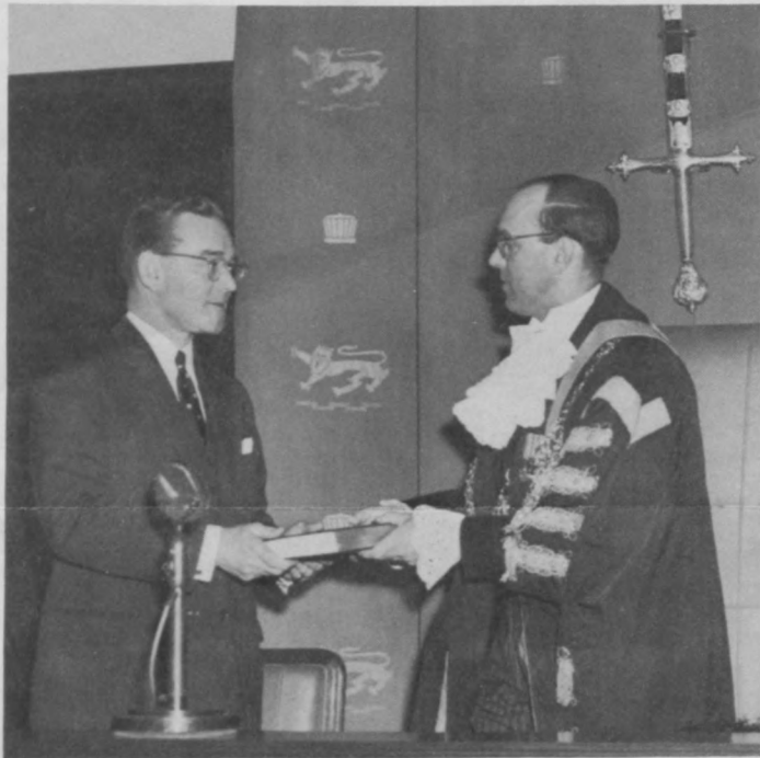
The Lord Mayor accepting the Roll of Honour from U. S. Ambassador Whitney.