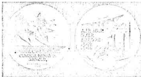
Spaatz, Arnold, and the European Air War

On sale at the Air Force Museum Gift Shop, Wright-Patterson AFB, Ohio is a series of medallions commemorating highlights of Air Force history. Among these is a handsome medallion having on its face the profiles of General Arnold and General Spaatz. The reverse portrays a B-24 Liberator on a mission raid.