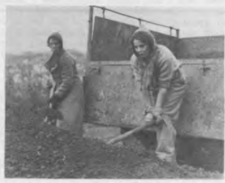
British ladies do their bit. Not only were they good but they were pretty also. They could handle a shovel as well as any man — and better than most!