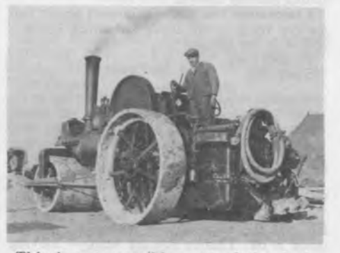
This is not something out of the dark ages. It's a British steamroller circa 1942, and a mighty steamroller it was when it came to smoothing out those runways.

The first of the new models B-24 with the nose turret arrives at Hardwick. Not only were the flexible nose guns gone but there were many other improvements and modifications.<sup>16</sup>