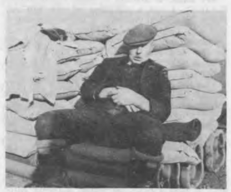
Sacks of cement make for relaxation and comfort during noon break for this civilian worker.