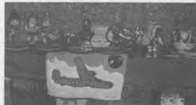
Items auctioned off by the 44th BG which brought in $800.00 for the Memorial Fund.