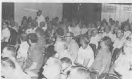
A question from the floor . . .