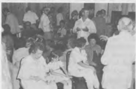
Hospitality room early in the evening. Should have seen it later!