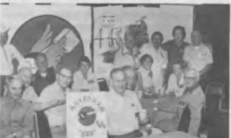
44th and 492nd members (plus a few strays) hold forth in the 'Shipdham Pub'.