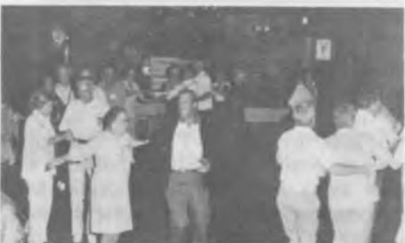
This was supposed to be a square dance, but come to think of it that's for old folks!