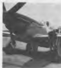
Here he braces the P-51