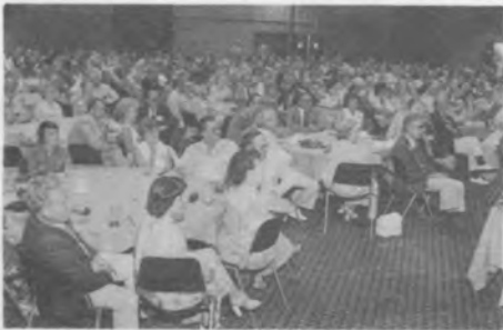
Banquet. Meal finished, tables cleared (mostly) sit back, relax and smoke as speakers speak. Only a portion of those who attended.