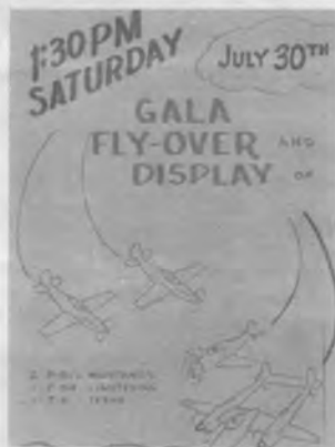
When this sign appeared in the Lobby it surprised everyone except Dick Brackus who arranged the whole thing.