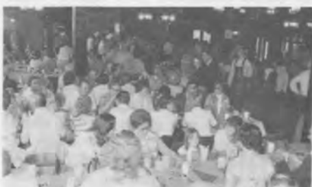
First night chow time at the ski chalet. Buffet style with long tables resulted in 'instant' friends.