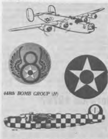
448th BOMB GROUP (H)