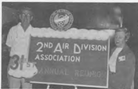
Since we finally decided that this was the 30th Convention we can use the same sign again next year. 'Red' and Lois Hand.