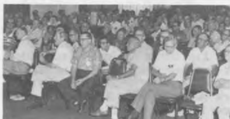
O.K. What's on the agenda?