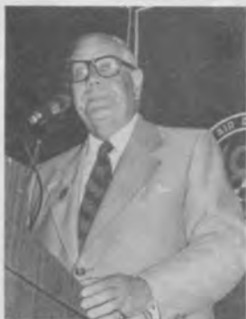
Jordan's task was not always an easy one.