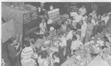
The Registration Desk went full swing all three days. Just a steady stream.