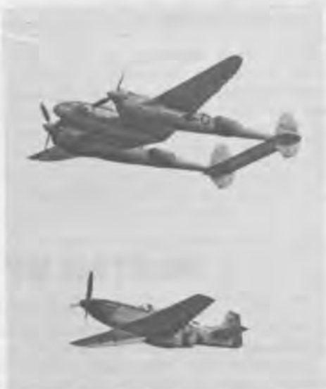
Look what dropped in for tea!