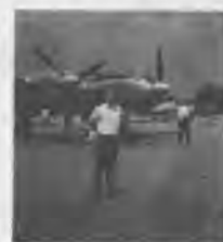
And here he 'gets near' the P-38!

Sorry no reunion pictures of the 453rd were ready for this issue of the newsletter. Perhaps we can get a couple in for the next issue.