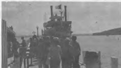
Waiting for That Mississippi River Boat on Lake Geneva