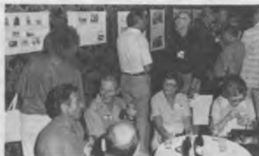
The Norwich Pub with it's photos tacked all over the walls was THE place to meet.