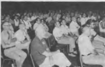
There were few empty chairs at the business meeting, and everyone there had something to say!