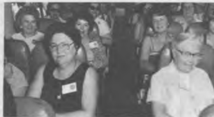
The ladies ready for their bus and shopping tour of San Diego. The busses were made out of spare B-17 parts as they didn't work too well!