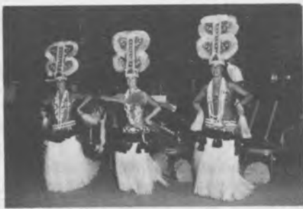
The Hawaiian dancers perform at the luau. A beautiful performance with exotic costumes.