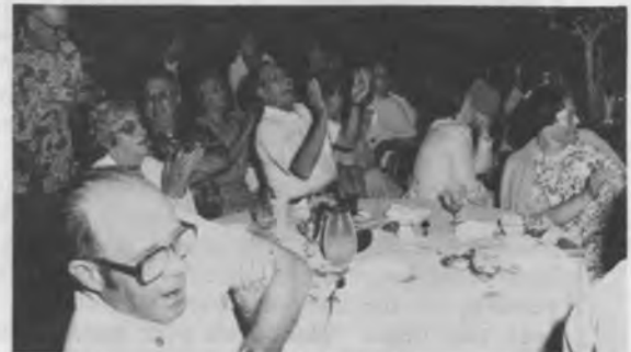
In spite of that everybody enjoyed and admired their courage.