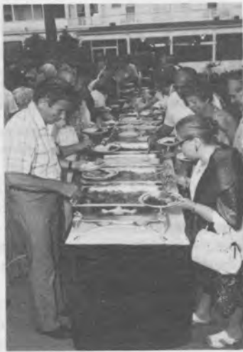
That damn chow line follows us wherever we go! This one, fortunately, had food you could eat.