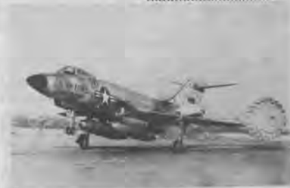
Compiled By DAVID J. GLOVER