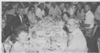
Everybody enjoyed the Luau in the Patio. You will have to pick yourself out because the names escape me.