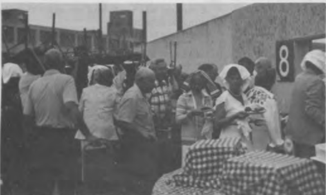
The rains came and the women adopted Arab headgear while those FFFs (fearless fighters of the forties) hoisted chairs.