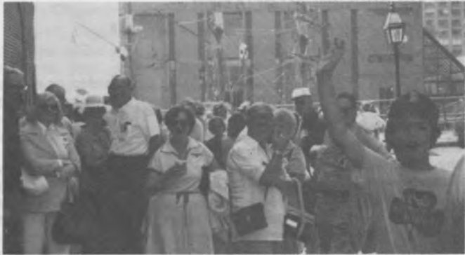
Waiting to board the Boston Harbor cruise ship. One of the "Tall Ships" in the background.