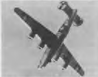
B-24 H-25-DT S.N. 42-51106. 392th B. G., 576 Bomb Squadron. Picture shows CI-A after repair by Swiss during ferry flight to Dubendorf.

During the war the famous Liberator flew many colors, including the RAF, Australian, Canadian, Italian, Swedish, German and Swiss. Switzerland was a haven for many Liberators and it is unknown how many took refuge there during the war. For the Swiss it was a sensation to see the first Liberator as their largest plane was a DC-3 flown by Swiss Air. A P-38 is credited with destroying a Swiss Air DC-3 on the ground at Stuttgart during a raid.