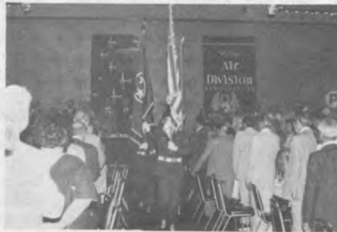
The Color Guard