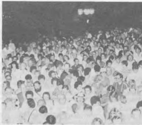
If you think 800 plus isn't a crowd take a look. And that's only part of them.