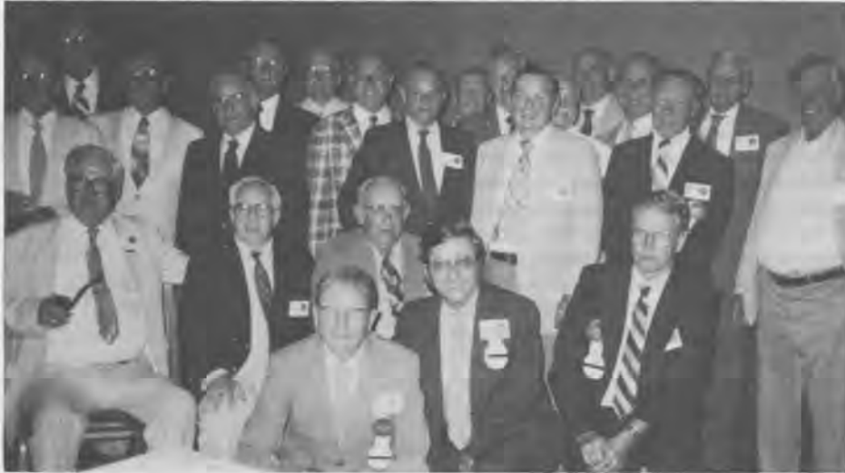
392nd Members at Nashville

Back to the serious; at the convention the Library Board, et al proposed, and it was voted by the membership at the mini-reunions and the general business meeting, to install a memorial to all Groups of the Second Air Division on the wall over the book shelves in the American Reading Room in the Norwich Library. I'm sure it will be detailed fully in this issue of the Journal , however, we will add we believe it will make our Memorial Room more impressive, and a more meaningful monument to our dead. There will be no doubt as to which Division sponsors the memorial!