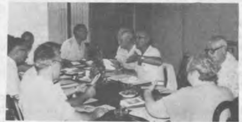
Your exec. comm., it wasn't all play for them.