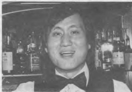
Don't know his name but most of us met him — the bartender.