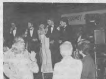
And the band played on — 40's style.