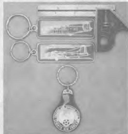
B-24 and B-17 heavy cast, vinyl covered 24K gold outlined aircraft $5.00 Second Air Division key ring $2.00 Postage and mailer 75¢