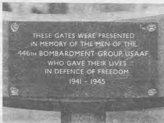
The memorial plaque on the new gates at St. Mary's Church, Flixton.

Three years ago some of the veterans returned to their old base and found that almost four decades of British weather had taken its toll on the memorial gates which were looking the worse for wear.