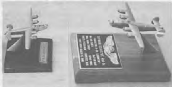
Left: $39.95 plus $2.50 Right: $55.45 plus $2.50

Send your order to: Rick Rokicki 365 Mae Road Glen Burnie, MD 21061