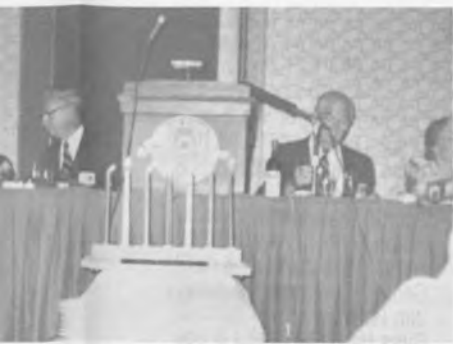
Memorial Candles for each campaign