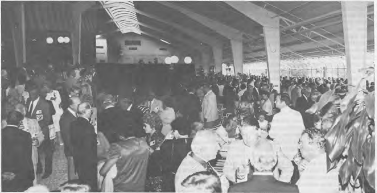
Cocktail time at the Atrium. Lots of people, but still lots of room.

The highlight of all our conventions, it goes without saying, is the candle lighting ceremony at the final night banquet when a