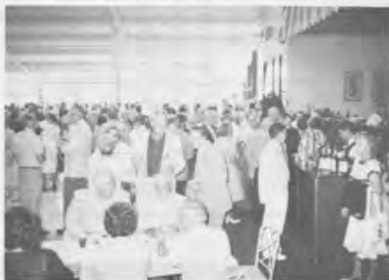
The mob scene.