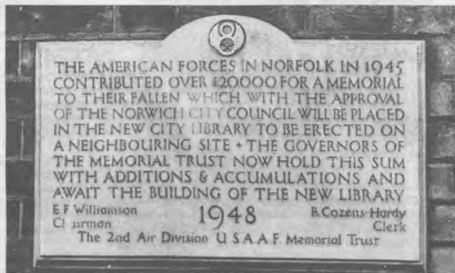
This plaque, erected in Bethel Street, Norwich in 1948, records the original American cash contribution and the intention to open a memorial library.

Membership of the 2nd ADA now stands at over 6000 and for the first time exceeds the number of American war casualties in East Anglia. A further indication of its