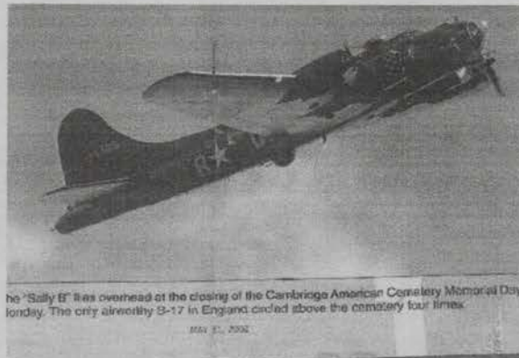
The "Sally B" flies overhead at the closing of the Cambridge American Cemetery Memorial Day ceremony. The only airworthy B-17 in England circled above the cemetery four times.

of World War II. She earned the nickname "Flying Fortress" because she was armed with 13 machine guns. She is now the only airworthy B-17 in the United Kingdom and is permanently based at the Imperial War Museum, Duxford. Ann will give a more complete and personal report at the convention.