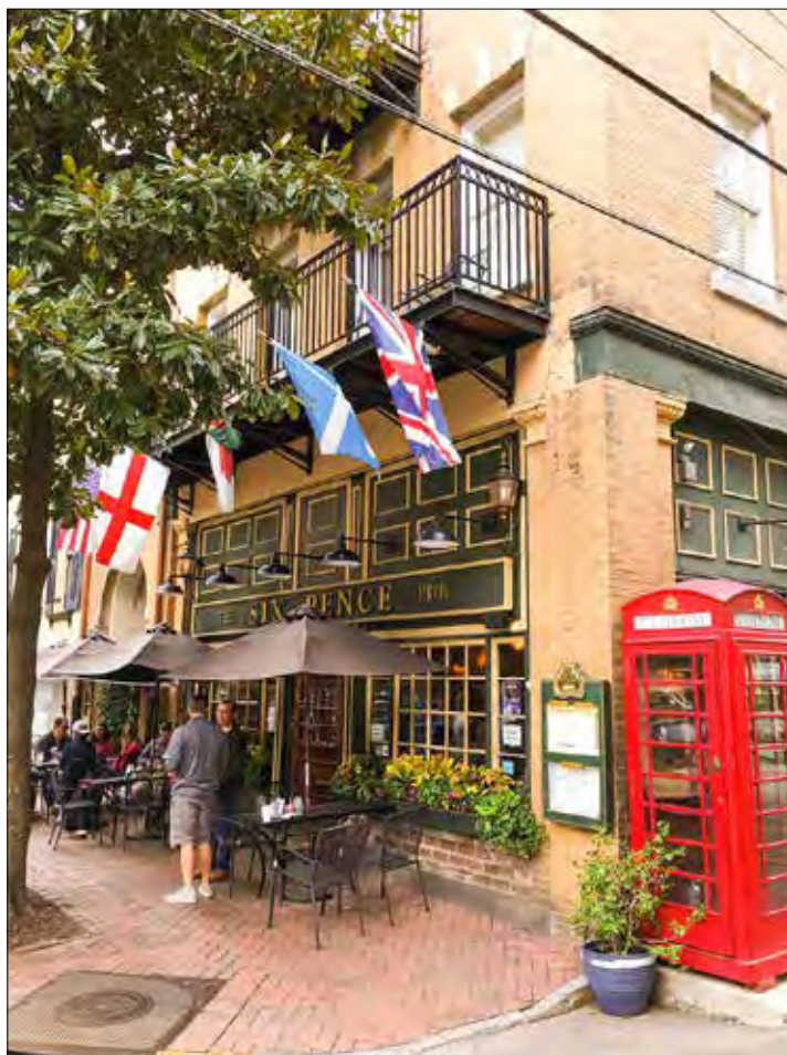
The Six Pence Pub provided a fitting British atmosphere for our conventioners. Many movie crews and stars filming in Savannah frequented here. If a pint would only cost 'six pence' today!