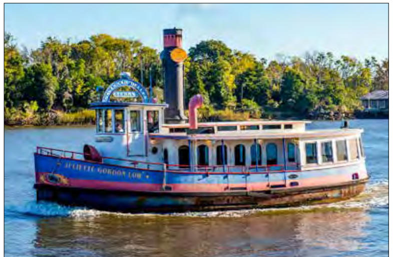
Savannah's water taxi provided pleasant transportation from the hotel to the main river front area.