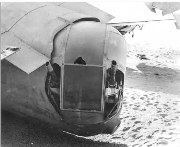
Lady Be Good . The tail gun turret with 50 cal's pointing up.