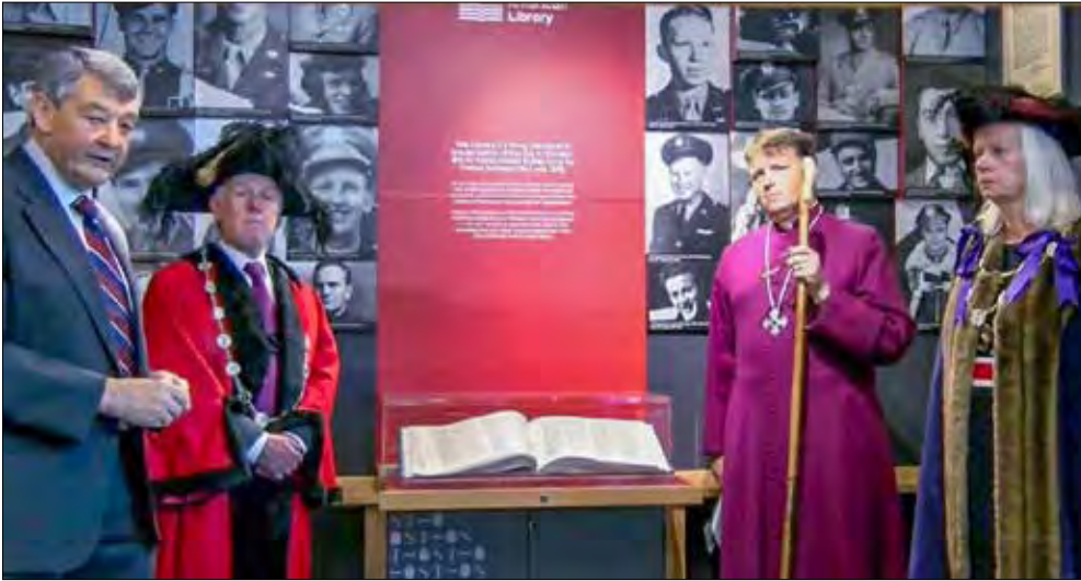
Local officials preside over the re-dedication of the Library 'Roll of Honor' exhibit last September.