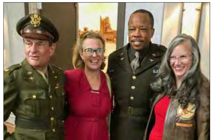
Dressed for the occasion, the officer re-enactors attending the Gala dinner.

It was great to see and visit with our WWII veterans. We were elated that eleven made it to the gala event on Saturday evening October 30th, and saddened over those who couldn't be with us.