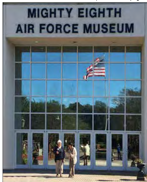
This year marks the museum's 25th anniversary. A proud American flag is reflected on the garden entrance from its post at the end of the garden's reflecting pool. The grounds provide a serene setting containing countless markers and memorials recognizing crews and their organizations. It is also the location of the special Memorial Day ceremony placing 26,000 flags memorializing 8th Air Force fallen. A British-themed Chapel also occupies the grounds.