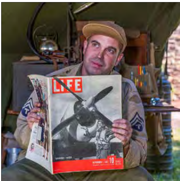
A P-47 is highlighted in a 1943 Life Magazine (only 10 cents!) as presented by a re-enactor on the museum grounds. The 2nd Air Division had four groups which flew the P-47 at various times.