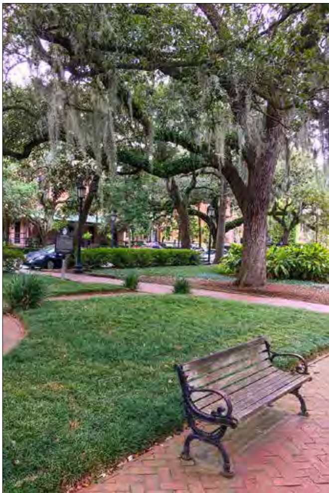
Savannah is known for its many squares in the residential areas. One of them, Chippewa Square, is where the film Forest Gump featured Forest on the bench with his box of chocolates. The draping Spanish moss makes for a serene setting. Of course, the movie company used their own bench for filming.