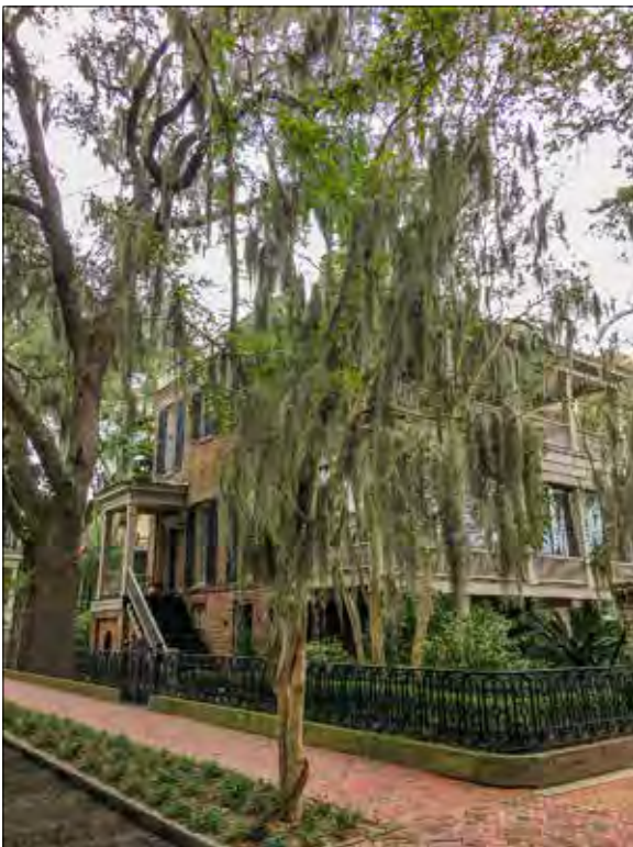
The draping Spanish moss provides a unique relaxed-air surrounding to the historically preserved homes in the residential area.

Breakfasts and dinners were a great time to catch up with old friends and meet new ones. That was easily my favorite time: sharing a meal, sharing our stories. Being surrounded by old friends and feeling like we were together last month instead of two years ago. This is what our community is about. 🌿