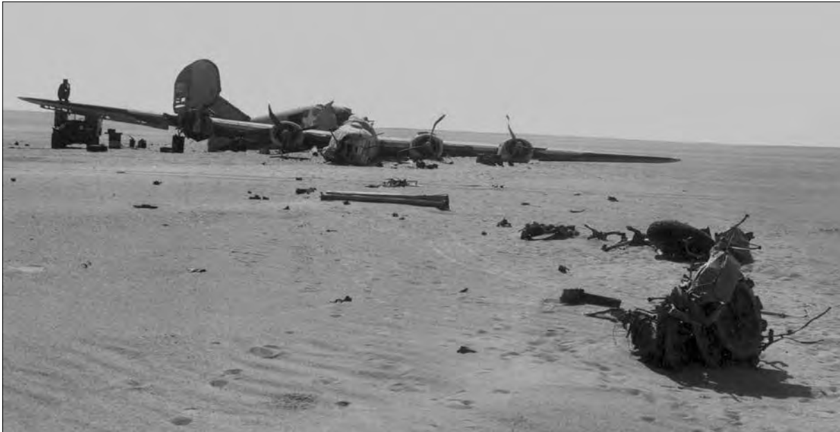
Another view of the wreckage site of Lady Be Good provides us a different perspective of the impact. The crew flew some 400 miles past their landing base near Benghazi, Libya before bailing out.