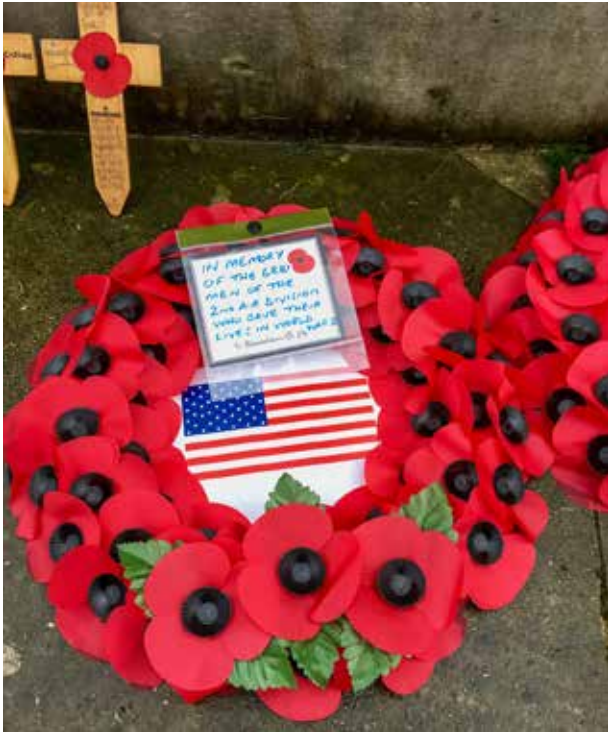
The Trust's wreath with attached message stating: In memory of the 6881 men of the 2nd Air Division who gave their lives in World War II.