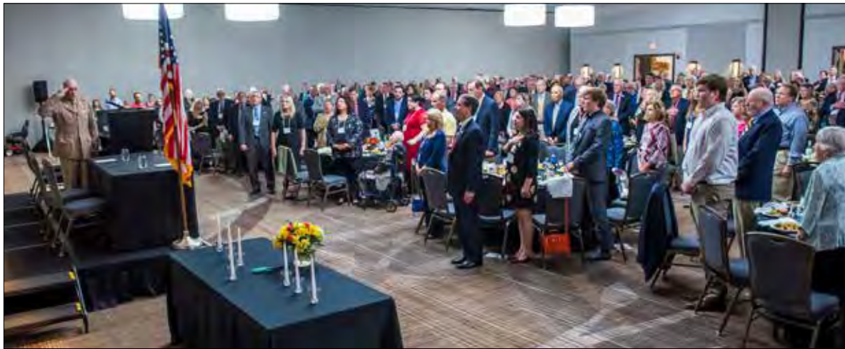
The audience of over 300 at the reunion finale gala dinner stand for the opening ceremony. In the foreground is the table containing the memorial candles.