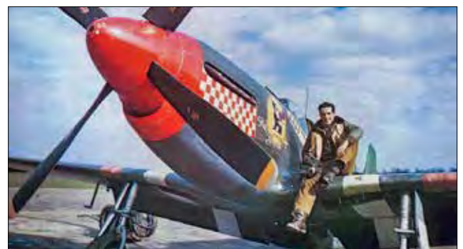
4th Fighter Group's most notable ACE was Don Gentile. Here pictured on the wing of his P-51 Shangri-La.

with the RAF. Transitioning from the Spitfire to the P-47, later the P-51, the group was the first fighter group to fly combat missions over German airspace, the first to escort bombers over Berlin, and the first selected to escort bombers on shuttle bombing runs landing in Russia. The group was credited with 583 aerial victories and 469 destroyed on the ground. The 4th FG produced 81 aces. Pilot Don Gentile was the group's leading ace with 19.83 kills.