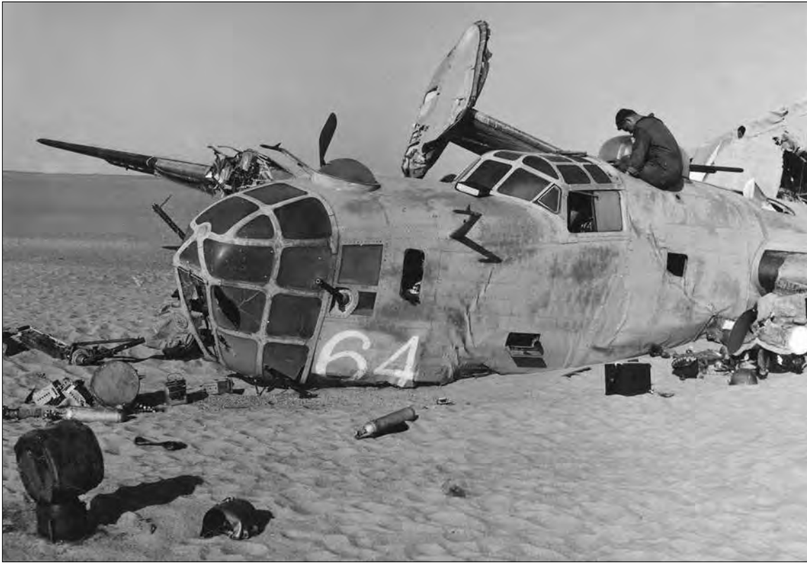
Lady Be Good flew on one engine for 16 miles before belly landing after the crew bailed out. Photo taken 16 years after the mishap.