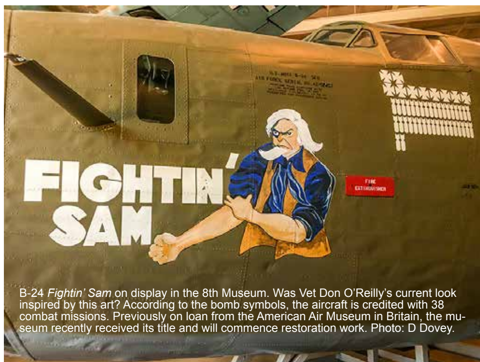
B-24 Fightin' Sam on display in the 8th Museum. Was Vet Don O'Reilly's current look inspired by this art? According to the bomb symbols, the aircraft is credited with 38 combat missions. Previously on loan from the American Air Museum in Britain, the museum recently received its title and will commence restoration work.