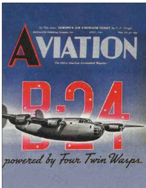
The B-24's first flight was December 29, 1939, from Lindbergh Field, San Diego. Happy 82 years! 18,484 were built until production ended in 1945.

First, a brief recap as to the origins of nose art. We can trace aircraft art back to World War I. Those symbols identified its unit and was usually painted on the aircraft's rear fuselage. During the Second World War, its artistry shifted to reflect the bomber crew's zeal and dedication. I consider it the golden age of nose art.