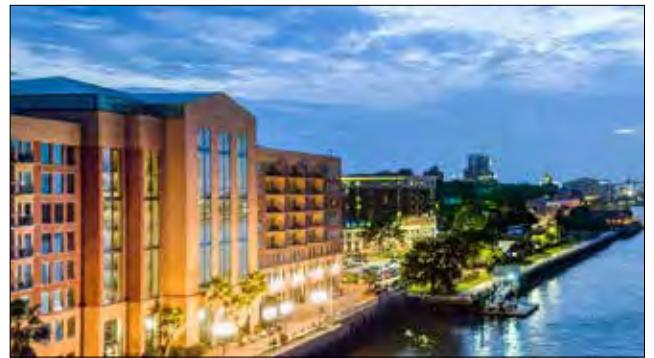
The reunion host hotel: Marriott Savannah Riverfront.