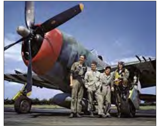
56th Fighter Group's most notable ACE was Francis 'Gabby' Gabreski. Pictured here among his P-47 and crew chiefs.

fighter group. The 56th produced 39 aces led by Frances 'Gabby' Gabreski with 28 kills.