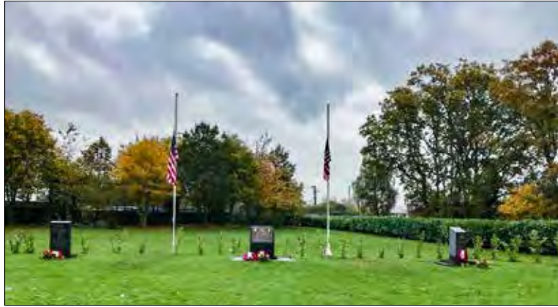
Halesworth maintains three monuments on behalf of the three groups stationed there during the war. They were the 56th Fighter Group, 489th Bomb Group and 5th Rescue Squadron. The ceremony included an aircraft flyover dropping poppies and was attended by a group of USAF active duty airmen.

The fallen were remembered here in Halesworth today. To our 489th Veterans, families and friends we send our greetings to you all on Remembrance Sunday. We hope you are all keeping well. The names of the air-