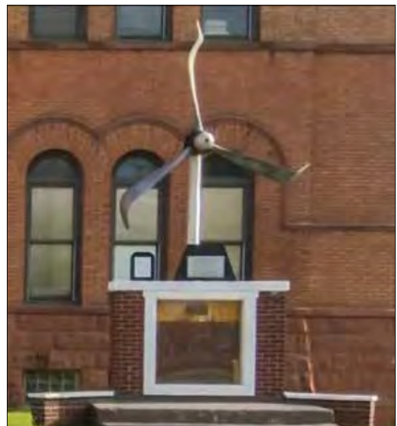
Propeller from Lady Be Good on display in front of the fire station in Lake Linden, Michigan. The plane's radio operator grew up there. Photo credit: WJMN [prop], U.S. archives

By permission: Newscast video courtesy of WJMN TV, 2021, Marquette, MI. Nexstar Media Inc. See the video at: https://www.upmatters.com/veterans-voices/the-tragic-story-of-wwii-aircraft-lady-be-good-that-took-