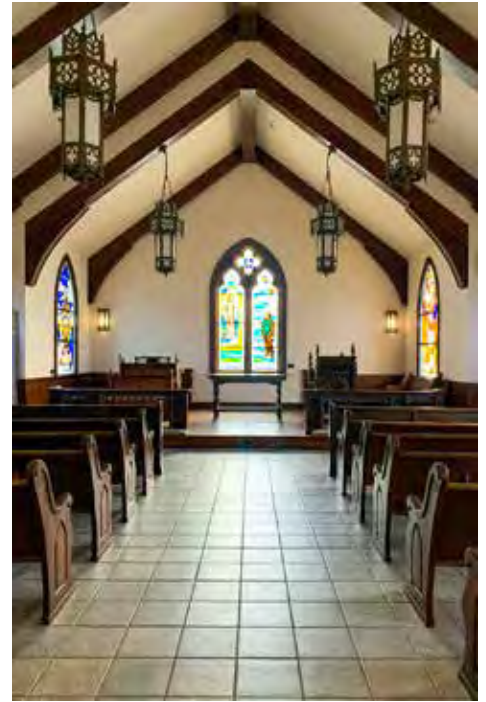
Interior of the 8th Museum Chapel of Fallen Eagles.